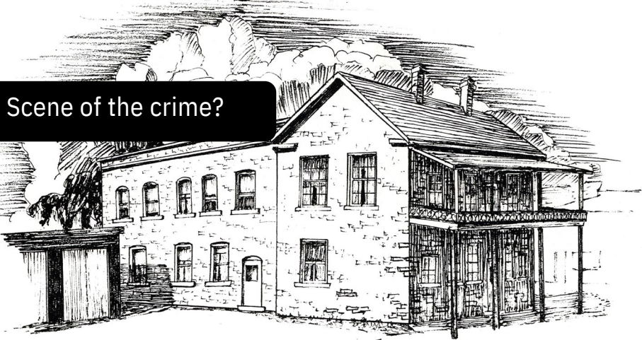
The Oxford House, later known as The Kirwin House. Built in the 1890s was one of Ingersoll's hotels. It was torn down in May 1947. It was situated on Oxford Street across from the present Blue Station.